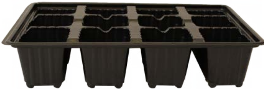
Seed Trays 12 Cavity 215x152x42