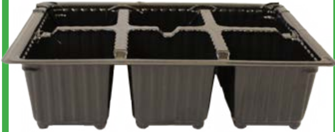
Seed Trays 6 Cavity Wide 215x152x55