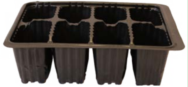
Seed Trays 8 Cavity 185x140x55