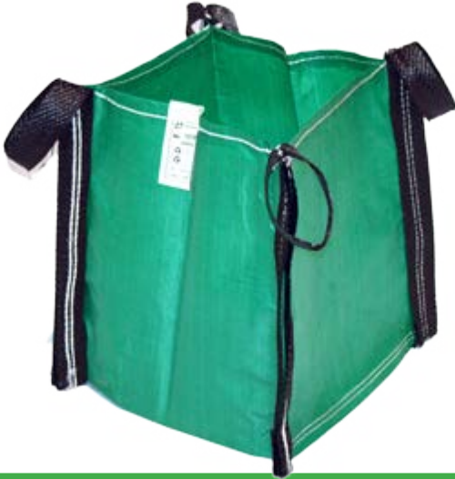
UV TREATED SLING BAG 50L